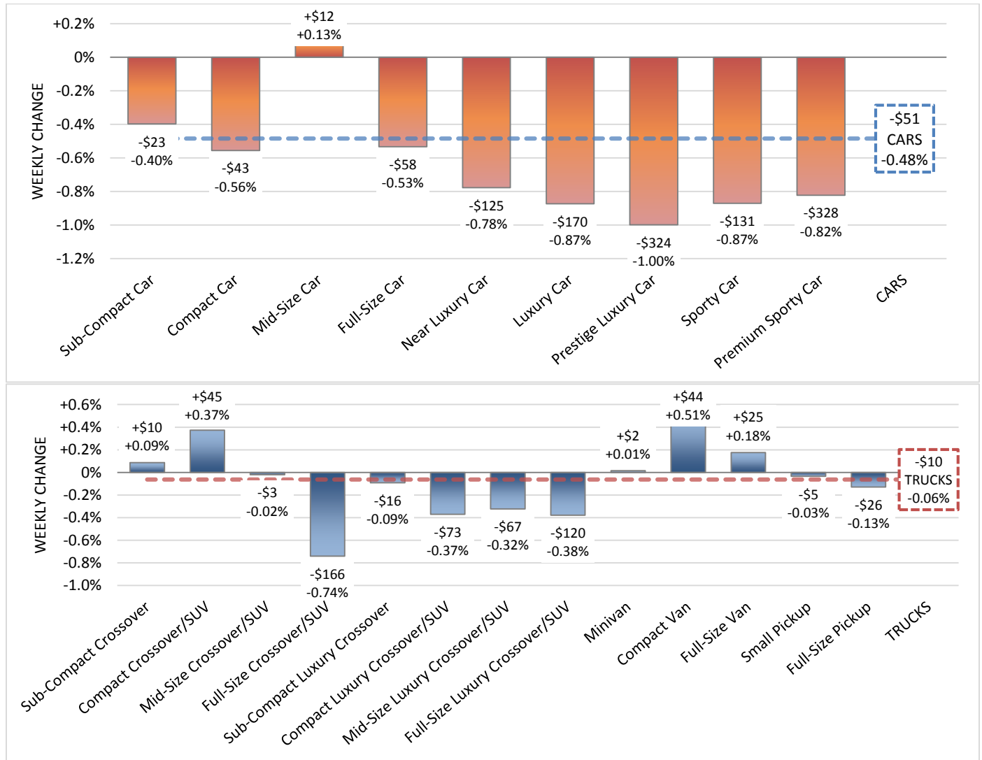
Model Years: 2009-2015, Volume-Weighted Wholesale Average Values, Weekly Change from 9/8/17 to 9/15/17

“Active buying continued last week as Texas dealers replenished their inventory. Compact SUVs and Mid-Size Cars did well.”